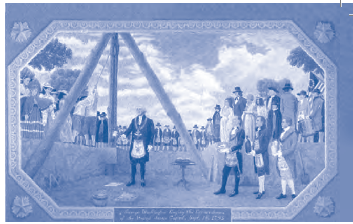
George Washington Brick Laying Ceremony

Most people are familiar with the well-known names of the American Renaissance: Dickinson, Emerson, Hawthorne, Poe, and Thoreau, for instance. But few are aware of just how much these authors' works were infused by esoteric currents and practices. Alchemy, folklore, and Platonism all intermingled to create what we now know as the American Renaissance, but which really represents the first literary, philosophical, and religious flowering of the United States. Could such a time come again?