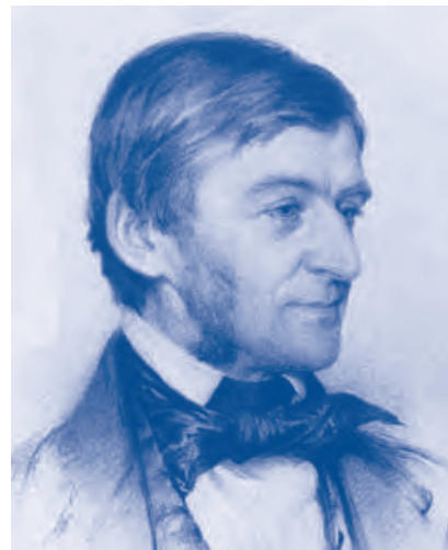
Ralph Waldo Emerson

Several prominent Founding Fathers were Freemasons and the legend of a Masonic influence in America's origins is a popular belief. But how true is the legend? What role did Masonry really play in the American Revolution and how did Masonry impact the new republic as the 19th century progressed? Is there an esoteric core to "the Craft," as some allege? This talk will pay particular attention to the Freemasonic experience in America, where a unique set of circumstances have produced a most paradoxical result: a secret society for the common man.