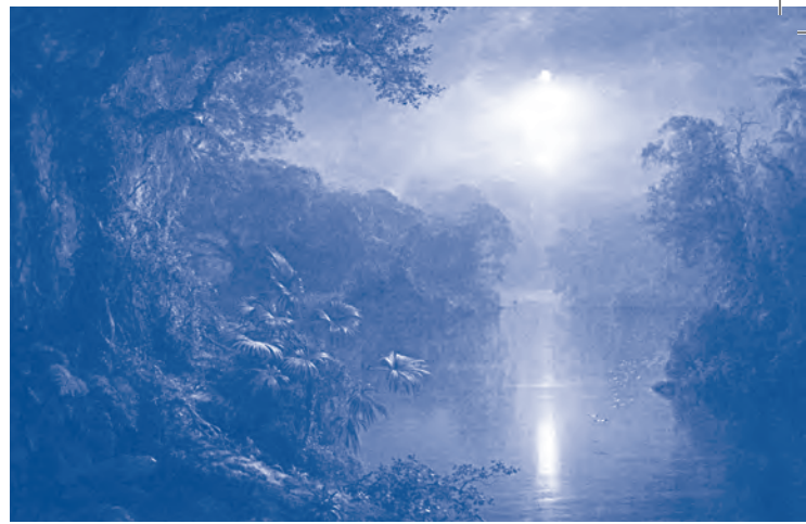
"Morning in the Tropics", Frederick Church, 1877

Paschal Beverly Randolph (1825-1875) was a 19th century Black American Spiritualist, Rosicrucian, and sex magician. It is a revelation to realize the poverty of what preceded Randolph and his monumental achievement in transforming occultism and spiritualism from antiquarian bookishness to the pursuit of individual spiritual growth here and now through practical spiritual techniques. The history of western and especially American spirituality since Randolph's death might be seen as the working out of his ideas on realizing our own divine nature.