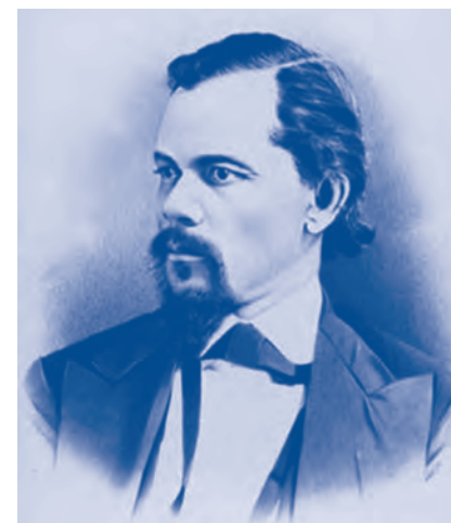
Paschal Beverly Randolph

We will work through some esoteric dimensions of major literary works – in particular, writings by Ralph Waldo Emerson and Emily Dickinson, but also a few others. Clearly, one can read such works on a surface level, but one soon discovers that they have multiple levels. At the same time, it is not uncommon for these authors to offer us an "open esotericism," in which the more esoteric dimensions of their work are hidden in plain sight.