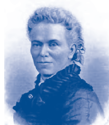
Matilda Joslyn Gage

What was in the water that made Upstate New York the hotbed of social justice and religious ferment in the country during the first half of the 19th century? A look at the childhood, religious background, and lifework of the triumvirate that led the radical wing of the woman's movement may provide some insights. Elizabeth Cady Stanton, Susan B. Anthony, and the most visionary of all, the forgotten feminist Matilda Joslyn Gage who was deeply influenced by the Iroquois peoples, speak to us from the past.